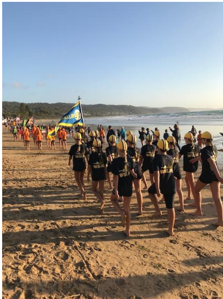
2019 WSLSC March Past team.

Thanks to everyone who has helped out across the season.