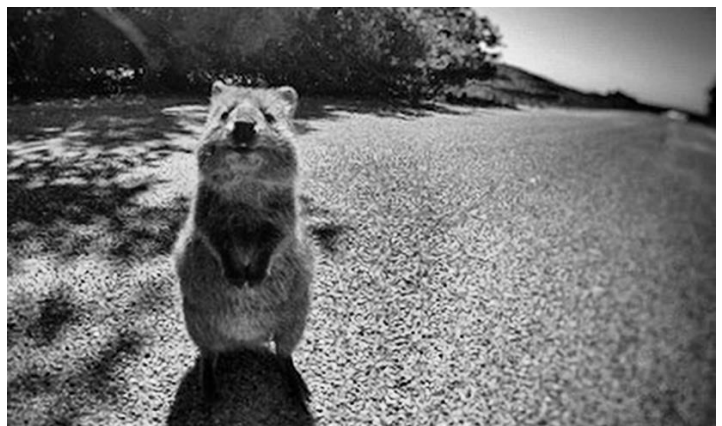
A Rottnest local.