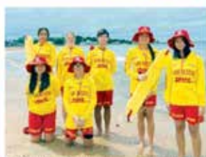
The six young lifeguards have learnt how to swim and now have their Surf Rescue Certificates.