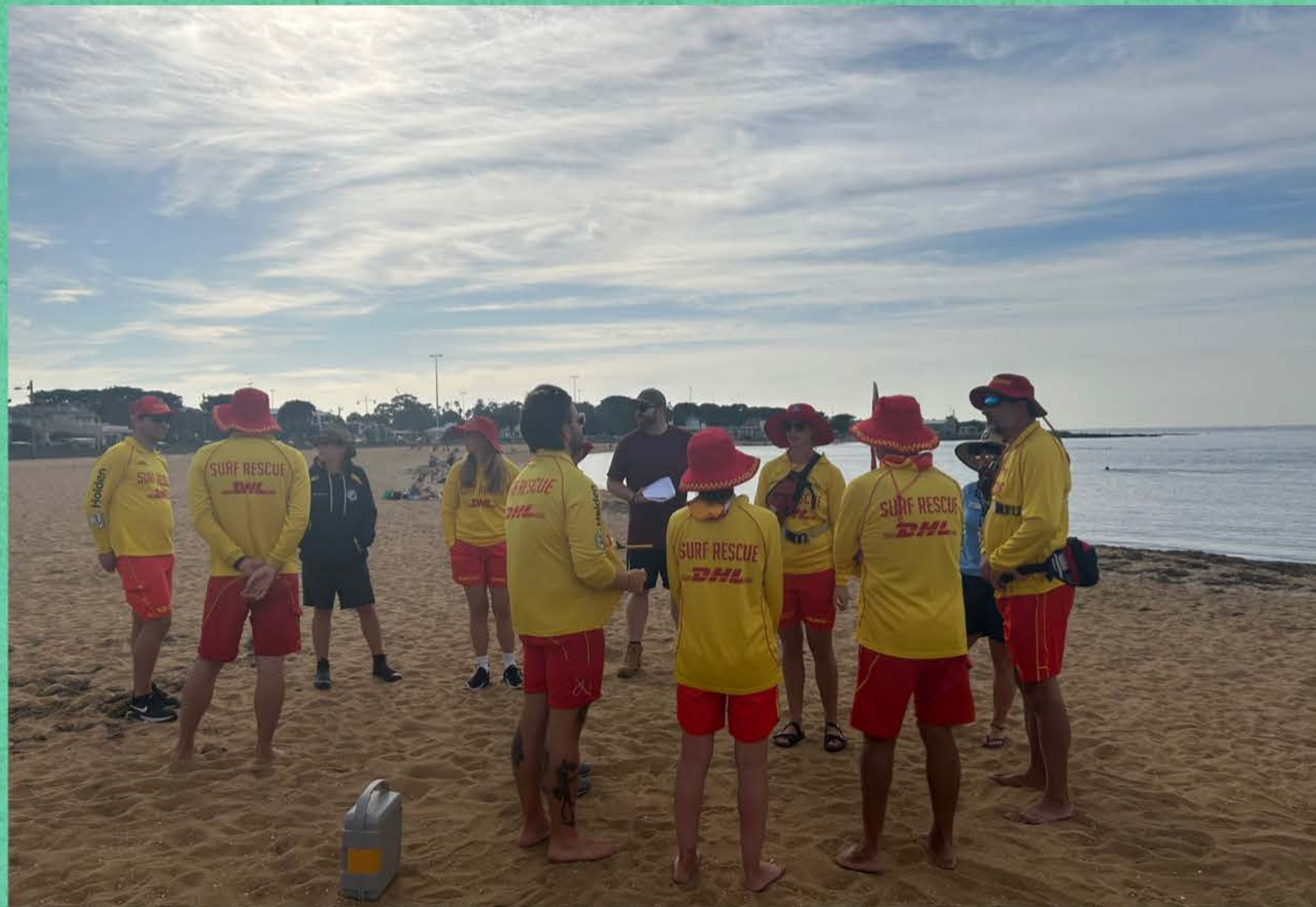
Silver medallion Patrol Captains scenarios