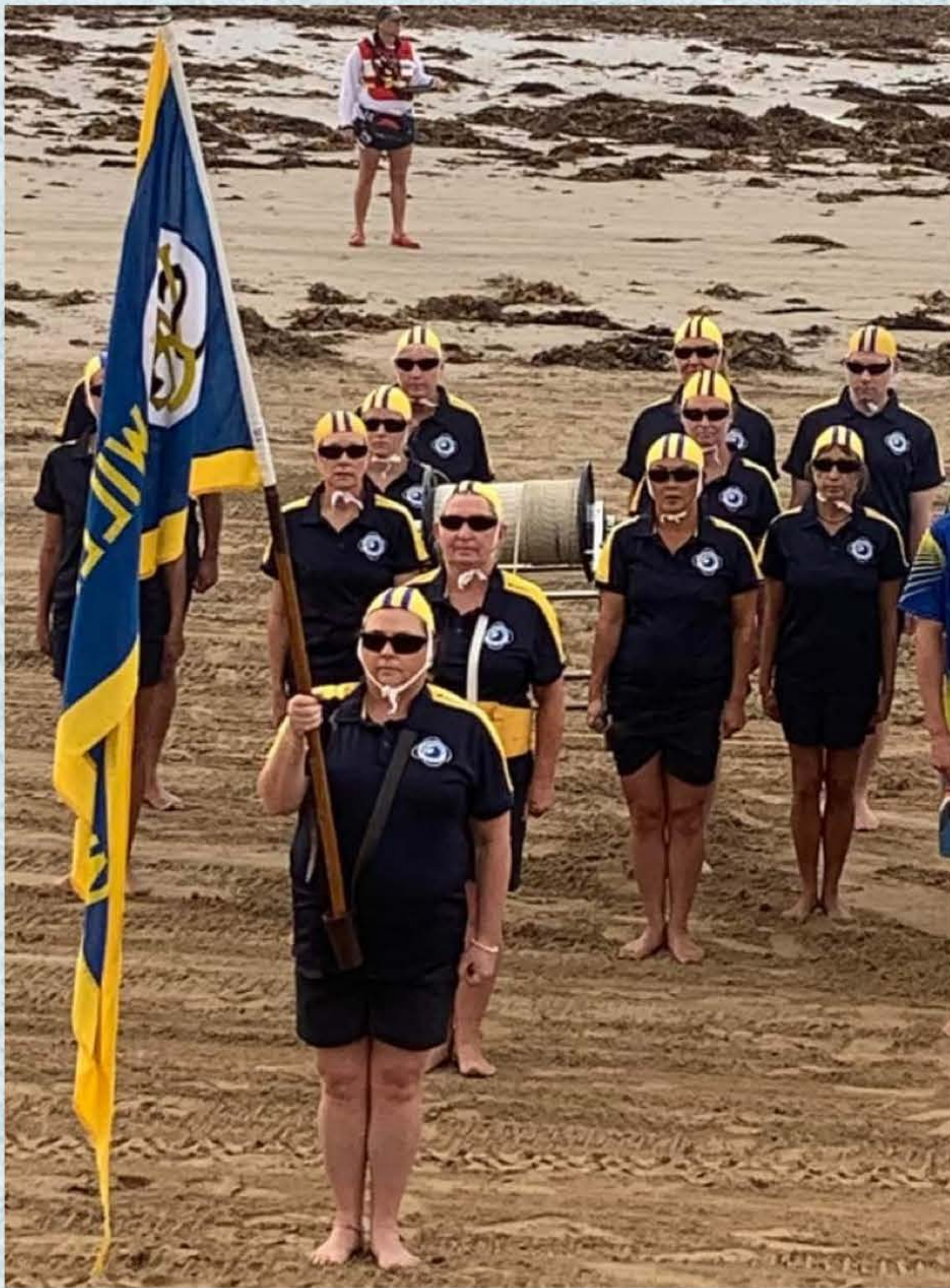
March past team photos